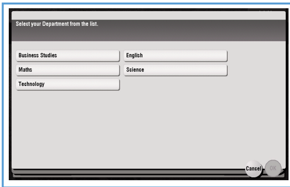
XPR Enterprise® Embedded Select Charge Code

AIT Ltd are UK based providers of print & copy software, ID cards and access control solutions.